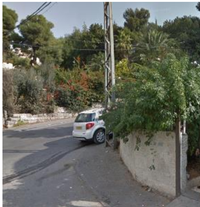
The jasmine shrub in Mount of Olives.

The current situation in East Jerusalem is marked by a series of ultra-punitive measures implemented by the Israeli authorities in response to the escalation that unfolded on October 7 th , 2023. The aftermath of the aggression on the Gaza Strip has seen a significant intensification of coercive tactics in East Jerusalem in violation of international law and the status of East Jerusalem as an occupied city, leading to a distressing environment for Palestinian Jerusalemites. The current reality demands international attention and a commitment by the international actors to hold Israeli government accountable on the basis of International Humanitarian Law to halt these actions and measures in East Jerusalem.